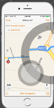
+ Navigator for ArcGIS

Use this set of ArcGIS apps in combination with Workforce for ArcGIS to maximise efficiency in your field workforce.