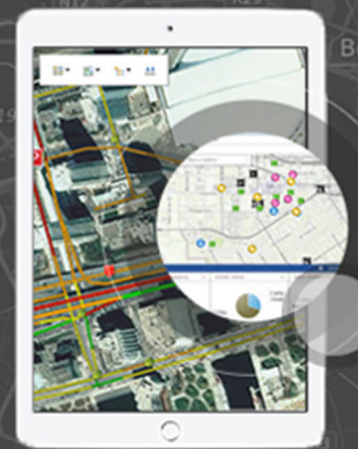
+ Operations Dashboard for ArcGIS

Use a form-centric workflow to capture data in any environment.